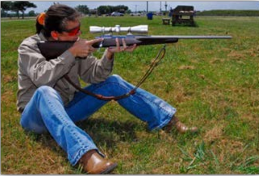
Figure 1 Sitting Position - open-legged

In the sitting, kneeling, and prone positions, the rifle forearm is supported by the palm of the hand. In the sitting and kneeling positions, the elbow is within 4" of the knees.