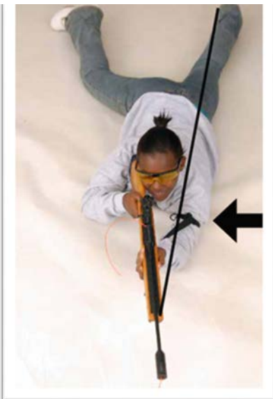
Figure 4 Prone Position. Lie on the mat with the left elbow under the left sideline. Adjust the left hand to raise or lower the sights to target level. Tighten the sling until it supports the rifle. Rotate the position until the sights point at your target.