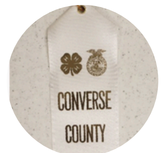
Exhibit and interview were poorly done or exhibit is not finished.

Static exhibits must be accompanied by a learning statement card, provided in this packet. Printed copies are also available at the Extension Office. You may also type your learning statement if you prefer.