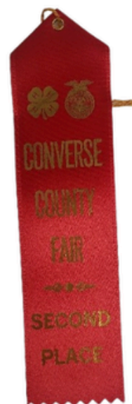
Red 1 point

The member with the highest number of sweepstakes points will earn the Sweepstakes Award. One award is given in each age division.