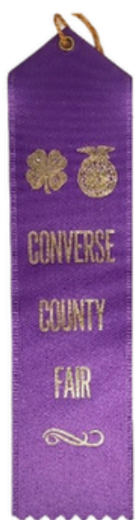
Purple 3 points

Each purple, blue, and red ribbon received on a static exhibit earns sweepstakes points. The more exhibits entered, the more points a member can earn toward the Sweepstakes Award!