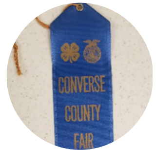
Exhibit and interview were well done. Blue ribbon exhibits move on to State Fair