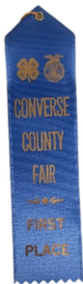
Blue 2 points